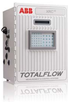
ABB Totalflow's Chemical Injection Application is designed to optimize the use of chemicals in a flowing well, in production lines and in pipe lines. The application has several modes of Chemical Injection: Batch, Continuous, Winterizer, Scavenger, Scale Inhibitors, Pipeline and Plunger Lift with Chemicals. The goal of this application is to enhance the injection of chemicals by using intelligent controls based on well and line conditions, not just a timer.